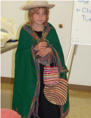
Dressed up like an Ecuadorian girl.