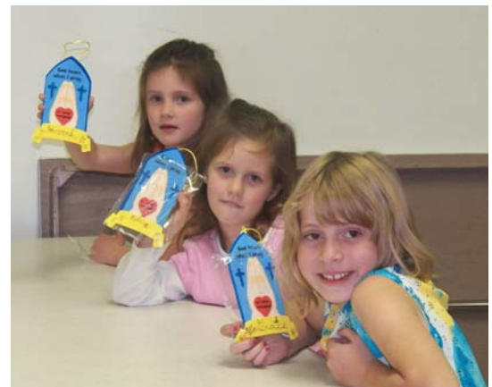
Doing a craft.