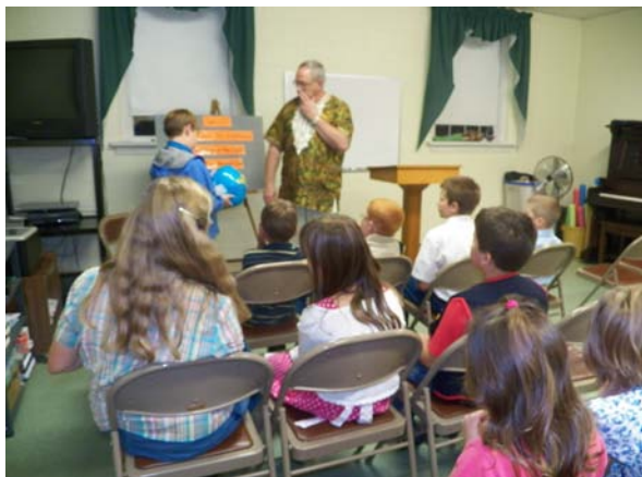
Learning some sign language.