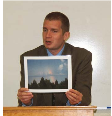
Hearing a story about Uganda.