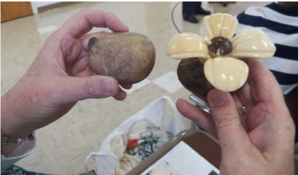
Beautiful things made from the rough.