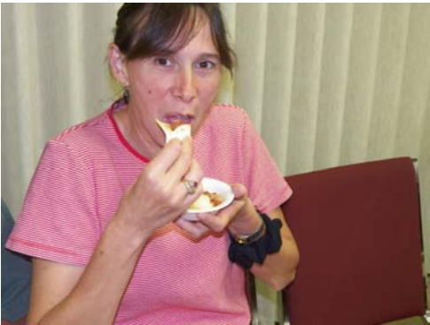
Trying casava and beans Ugandan style.