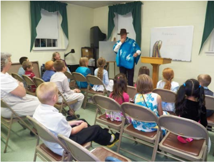
Learning about Ecuador.