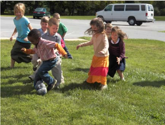
The kids enjoyed trying to play soccer using Ugandan soccer balls made of plastic grocery bags.