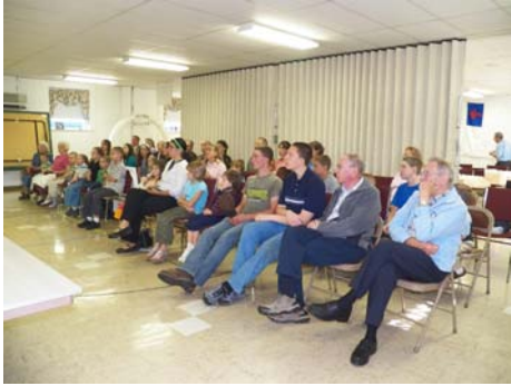
Morning sessions are informal and informative times of learning.