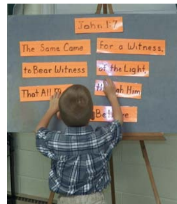
Learning the conference verse.