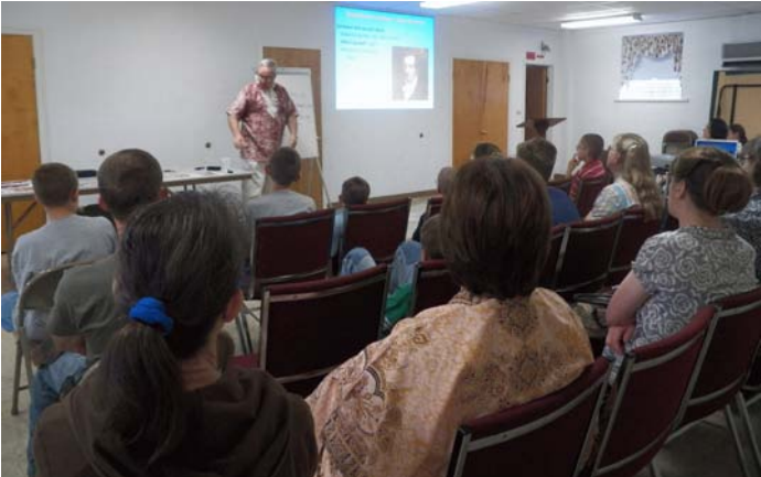
Learning the history of sign language ministry.