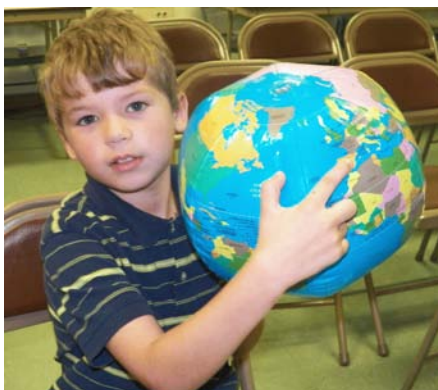
Finding where our missionaries serve.