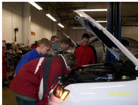
The Mechanic Shop