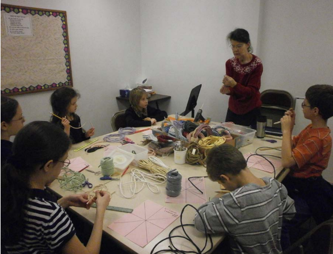
Learning to weave baskets.