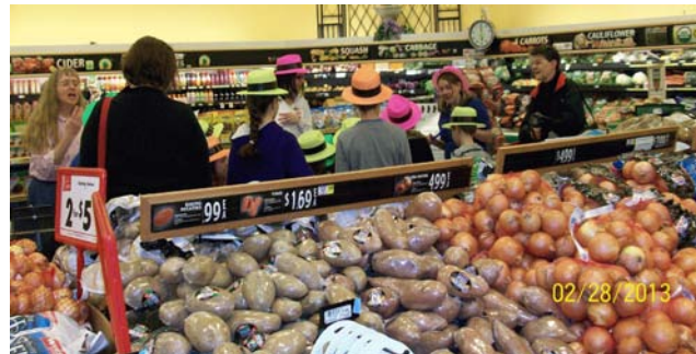
Grocery Store Tour