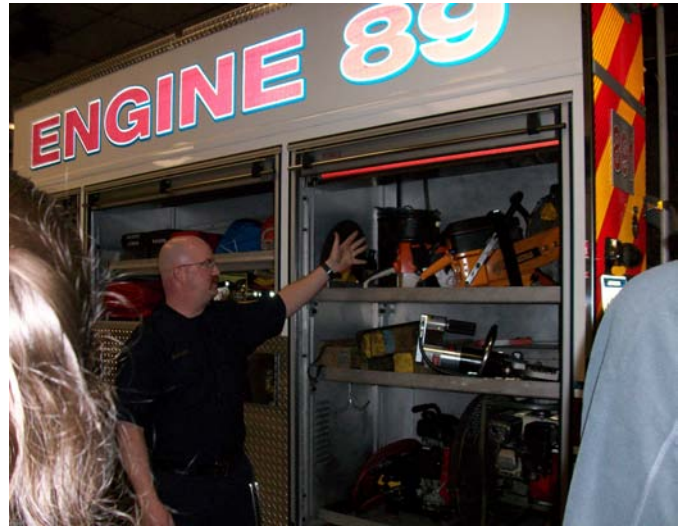
Seeing the Fire Station, Fire Trucks, and Ambulance