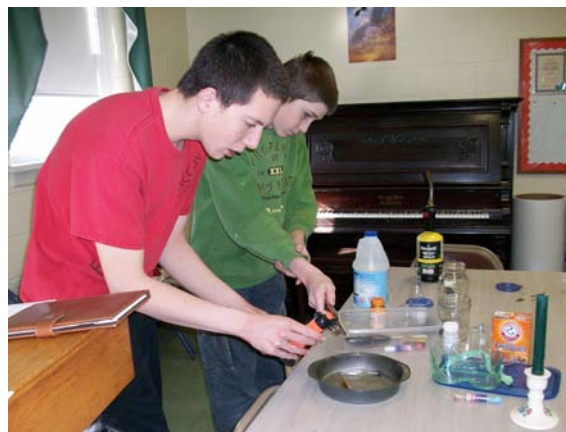
Learning about chemical reactions.