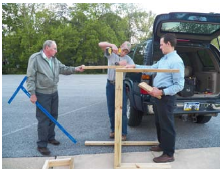
(Making props for the conference)

The dates for the conference will be September 26-30. Our church picnic will be held Saturday, September 26. The missionaries participating in the conference will be with us for the picnic and introduce themselves to us at that time. We will also have the morning sessions on Monday, Tuesday, and Wednesday again this year at 10:30 AM; so homeschoolers, you may plan your schedules accordingly for September 28-30. Watch for news about the conference as it develops. The teens have already started on the decorations. The theme this year will be "The Harvest is Plenteous, the Laborers Few." 📖