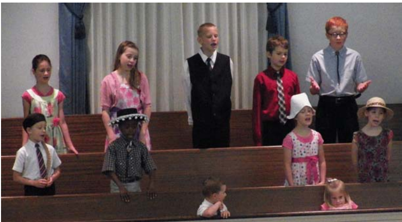
All the departments together sang Blessed Assurance to start off the program, and Every Moment of Every Day to close the program.