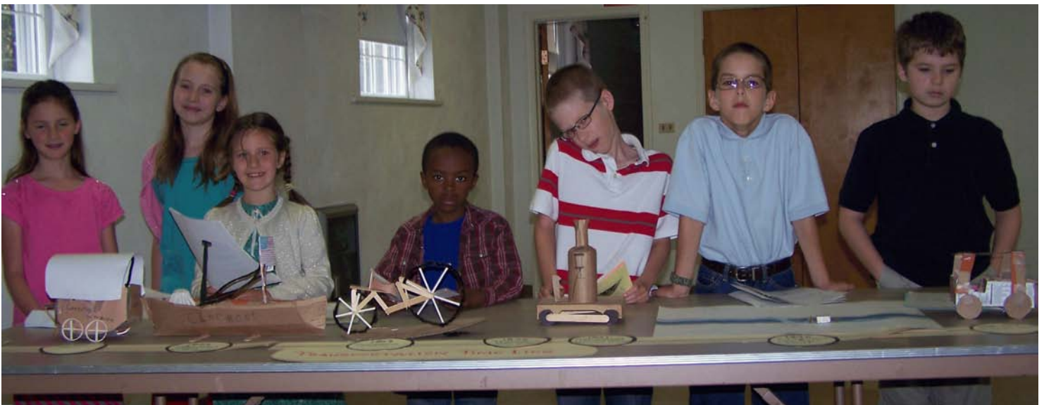
Demonstrations of vehicles