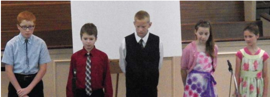
The Juniors talked about various places Paul went on his missionary journeys, and acted out when the snake bit him after the shipwreck.