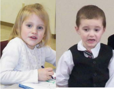
The Preschoolers quoted Psalm 100.