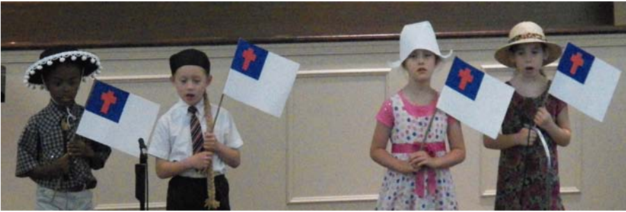
The Primaries quoted: