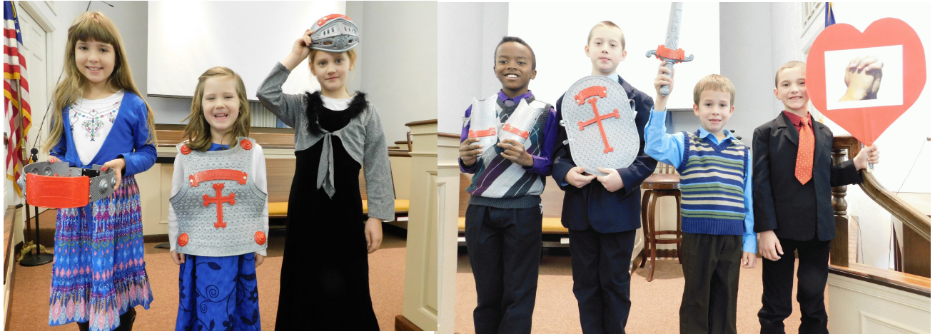
Hope, Elisabeth, Esther, The belt, the breastplate, and helmet,