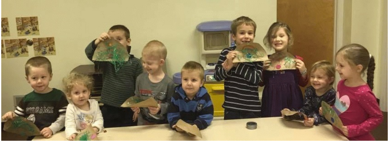
Showing the wigwams they made.