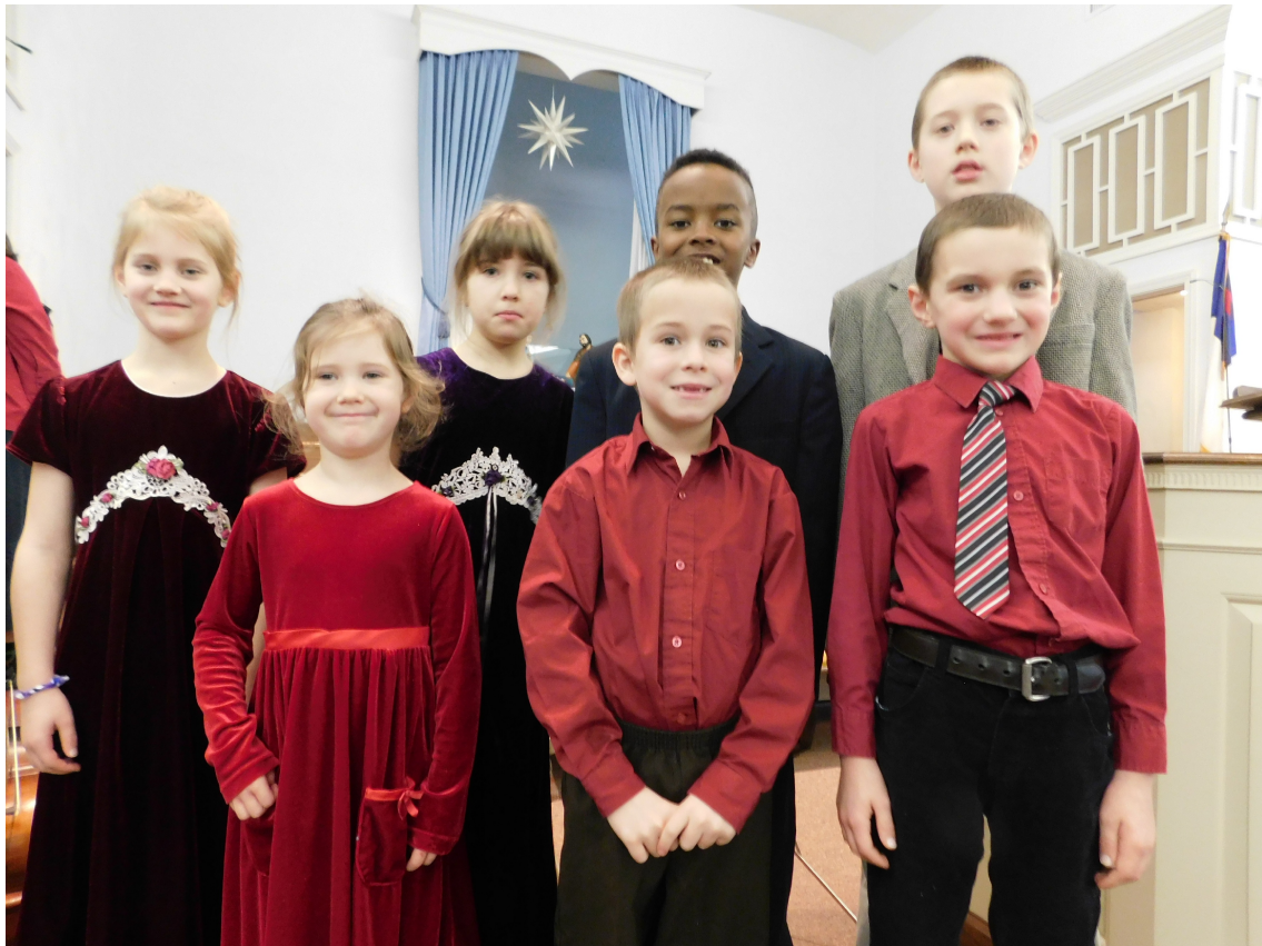
Ready to sing Christmas songs.