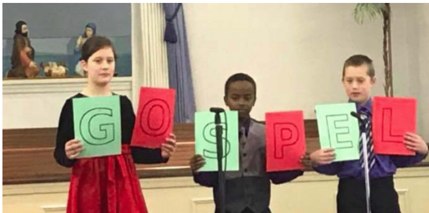
Juniors: Explaining the Gospel. They also quoted Philipians 4:4-13