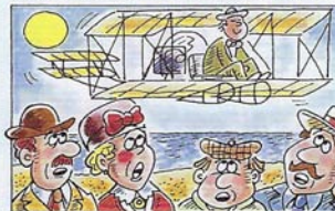
People laughed at the Wright brothers' attempts to create a flying machine, but in 1903 they flew the first airplane