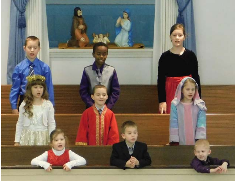
Singing "Angels We Have Heard on High"