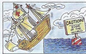
People said that Christopher Columbus would sail off the edge of the earth, but in 1492 he discovered America.