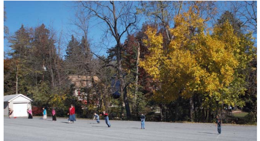
Gym class outside. RUN!