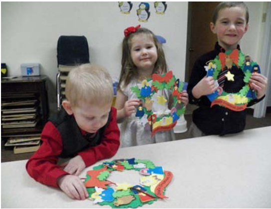
Preschoolers making a Christmas wreath with figures from the nativity.