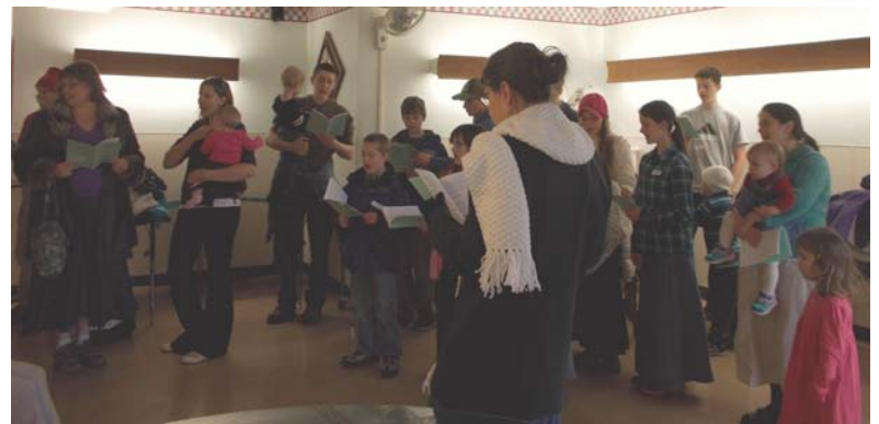
Christmas caroling to the shut-ins.

Homeschoolers signed home-made cards and mailed them to the shut-ins they didn't carol to.