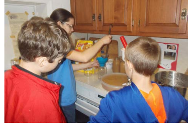
Making applesauce together. YUM!