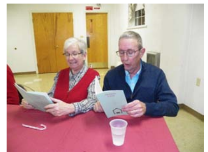
Singing the familiar Christmas carols together.