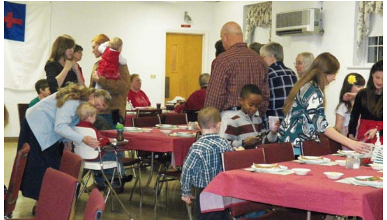
Enjoying visiting with each other as they arrive.