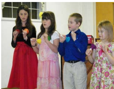
Special music and a message from God's Word.