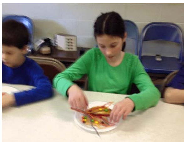
They made hearts from food.