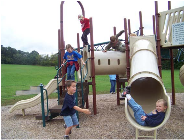
(On the playground)