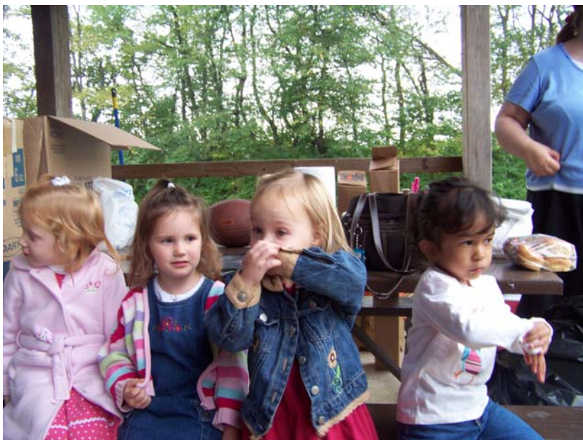
(Moving under the pavilion when it started to rain)